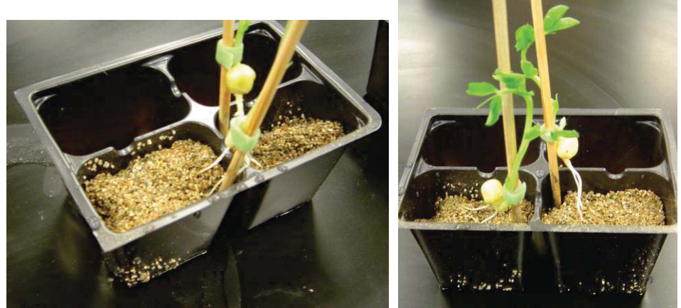
Fig. 4 . Fence-sitter scenario where shoots from each plant are positioned on the pot rim and half the root mass occupies each pot (left picture). Owner scenario where each plant owns a single pot; thus, total root mass for each plant is isolated in a separate pot (right picture).