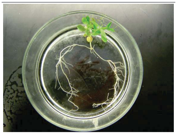
Fig. 1. A mature split-root pea plant.

Although the split-root technique was developed over 100 years ago (Bohm, 1979), its recent resurrection provides a unique tool for investigating environmental effects on root development and rootshoot interactions. Germlings are manipulated during development to form two equal or twin root masses (Figure 1). For experimental purposes, a split-root plant is positioned on the fence with its root halves in separate pots to create a "fence-sitter," while another split-root plant has its twin roots in a single pot,