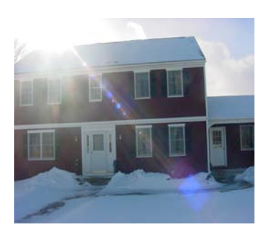
Chris's home at Pathfinder Village