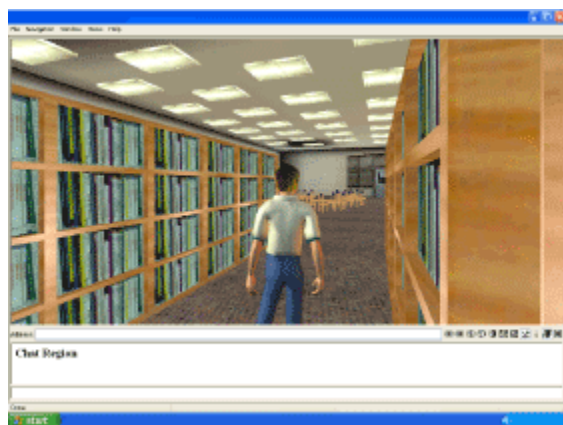
Figure 2. Virtual Reality Information Literacy Learning and Assessment Space (VILLAS) [ Back to Article ]