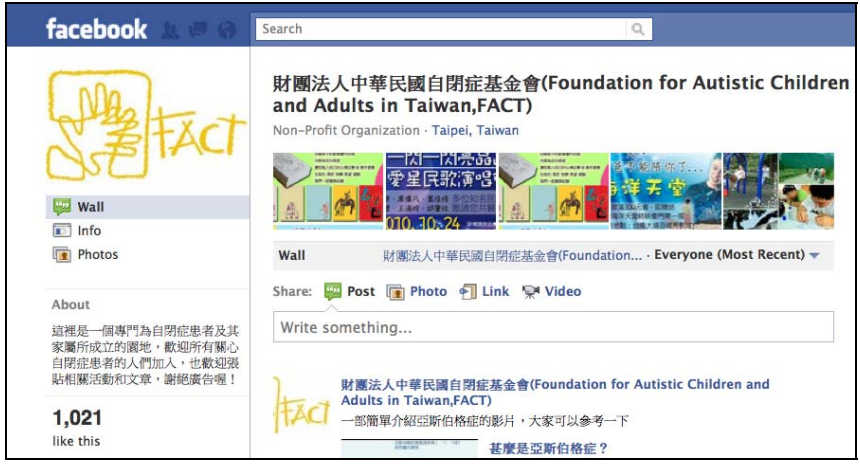
Figure 4: The FACT Facebook page

Dynamic interaction addresses on the importance of increasing interactions between the organizations, professionals, and adults with ASD. For example, the FACT and HYVH have to find possible solutions to develop viable human resource arrangement for non-working time in the interdependent homes since it is a home-based long-term care model for adults with ASD and their parents. Therefore, dynamic interactions are highly recommended and technology can play a crucial role to facilitate better interactions between the organizations and these family members. For example, the immediate communications via Web 2.0 technology (e.g., Facebook, Plurk, Twitter, Google+) are advised to increate the dynamic interaction. Figure 4 demonstrates that the FACT has begun to use Facebook to interact with individuals with ASD and families who have children or adults with ASD.