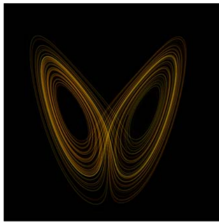
Figure 2: An icon of chaos theory - the Lorenz attractor

Theories are constructed in order to explain, predict and master phenomena (e.g. relationships, events, or behavior) to make generalizations about observations and to consist of an interrelated, coherent set of ideas and models. Complexity theory has been pervasively applied in a variety of professions to adapt to multiple environmental changes and multidisciplinary collaboration in recently research (Paley, 2007). Evolved from Chaos theory and the idea of Lorenz attractor (Figure 2), complexity theory which emphasizes uncertainty and randomness constructs a non-linear dynamic system that traditional organizational theories are inability to explain and predict. In the healthcare- and education-related literatures, there is a growing attention in complexity theory and its implications. For example, there are a variety of research and professions that employ complexity theory as the theoretical framework in their studies, such as medical education (Fraser & Greenhalgh, 2001; Rees & Richards, 2004), health promotion (Wilson & Holt, 2001), shared care for patients with long-term mental illness (Byng & Jones, 2004), and healthcare management (Plsek and Wilson, 2001).