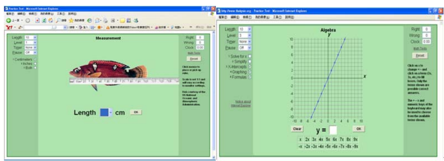
Figure 1 Computerized constructed response items (Thatquiz, http://www.thatquiz.org/)