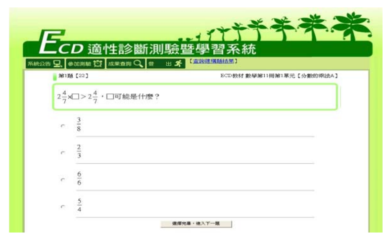
Figure 2 Interface of multiple choice items

In figure 2 and figure 3 the test interfaces of multiple choice and constructed response items are shown. The responses, like the equations or the fractions, can be inputted by using the tool the system provided adaptively for each CR item. The inputted equations will be displayed in the response area and recorded by LaTeX format. Table 1 is an example of an inputted equation and the corresponding codes in the database.