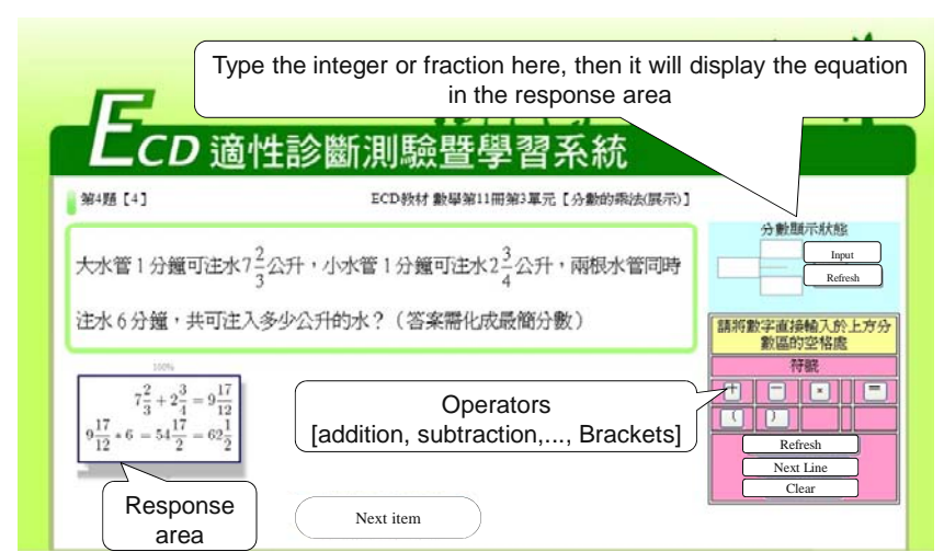
Figure 3 Interface of constructed response items