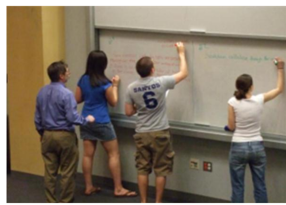
Fig 2. Small groups' representatives presenting their responses on the white board.

Multiple channels of communication The instructor used multiple channels of communication with the students: Power-point presentations, white board, and videotapes. In an interview early in the course regarding his plans and