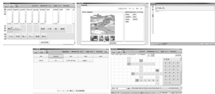
Figure 2. Snapshots of vocabulary exercises

There were 5 sub-exercises for each set of vocabulary exercises: matching, filling in the blanks, spelling, unscrambling sentences, and crossword puzzle. An on-screen version with a different visual exposure was prepared for the computer group (see Figure 2 below). The vocabulary tests included one pretest in the form of a recognition checklist and two posttests, immediate and delayed ones, which were composed of recognition and production parts. The post questionnaire was designed to explore learners' perceptions of learning in a computer-supported collaborative environment, with some open-ended questions included.