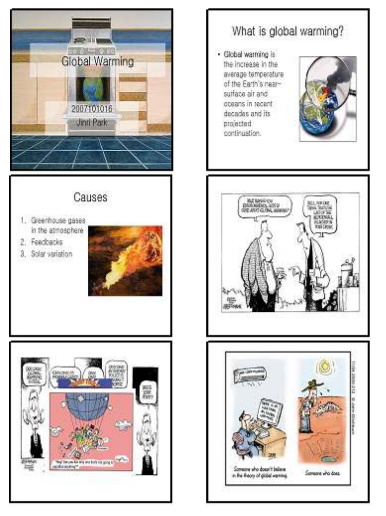
Figure 1. A sample of a student's presentation on global warming

The following is a sample presentation on global warming. This particular student approached a somewhat boring topic to most of her classmates with light and interesting materials using comic strips, cartoon materials, and various visual clips. She presented it very nicely and intriguingly. Other than her written script, she added interesting explanations on each picture spontaneously.