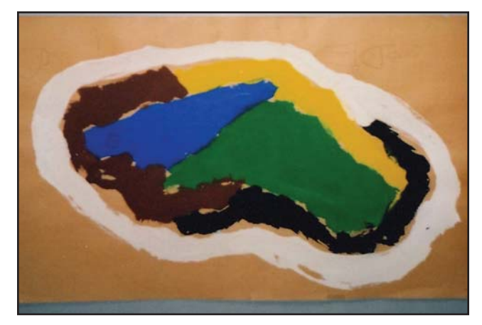
Figure 1 "White Enclosure with Shapes" (age 9)