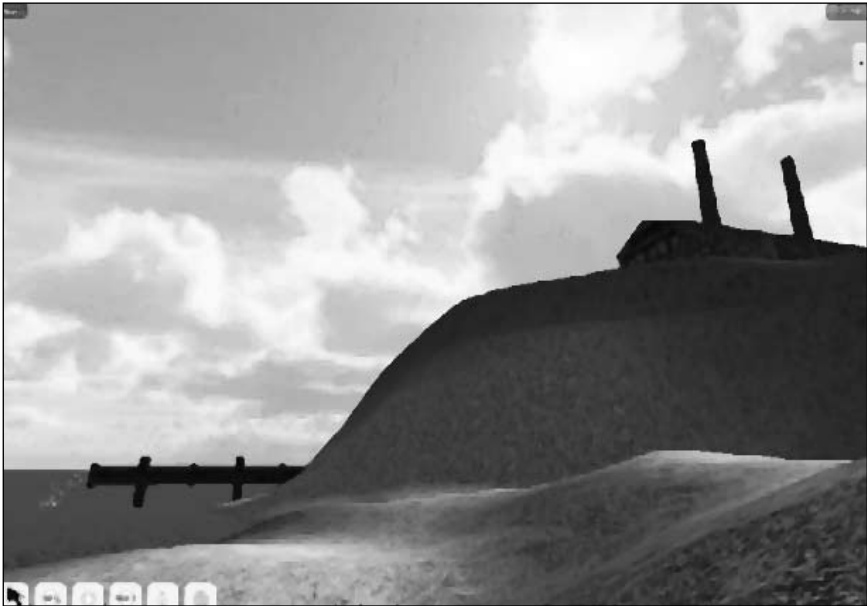
Figure 5: Visual clues.

on construct validity. We will employ similar methods to those carried out in the Validities of Science Inquiry Assessments (VSIA) (Quellmalz, Kreikemier, DeBarger, & Haertel, 2006). We will conduct both an alignment analysis and a cognitive analysis of our assessments, because these methods provide valuable, separate sources of validity evidence (Quellmalz et al., 2006).