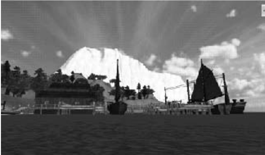
Figure 3. High-fidelity virtual assessment.

example, there is a Park Ranger, an NPC that we have programmed, who is the initial quest giver and contact in the bay for the student. The other NPCs are located throughout the bay and provide hints or distracters for what is causing the problem. For example, at the wharf are fishermen, a hiker, and a power plant employee. These NPCs will respond to multiple questions, but students must select only one or two questions to ask. Thus, students have to make decisions about what questions to ask people in addition to what type of tests they need to conduct to gather data. These actions are all recorded and provide observations about students' inquiry processes.