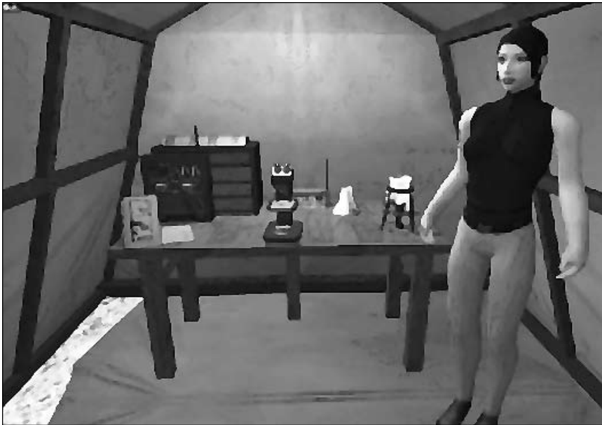
Figure 4. Avatar.

In the real world, allowing students to conduct an experiment has limitations. In a virtual setting, we can add as many constraints we want or leave the problem space open. Students are able to choose what kind of change they want to make within the bay (shut down a power plant that is dumping a substance into the bay, build barriers to prevent runoff from going into the water, plant trees, etc.) and then make that change. They then go into the environment and investigate how that change effected the kelp.