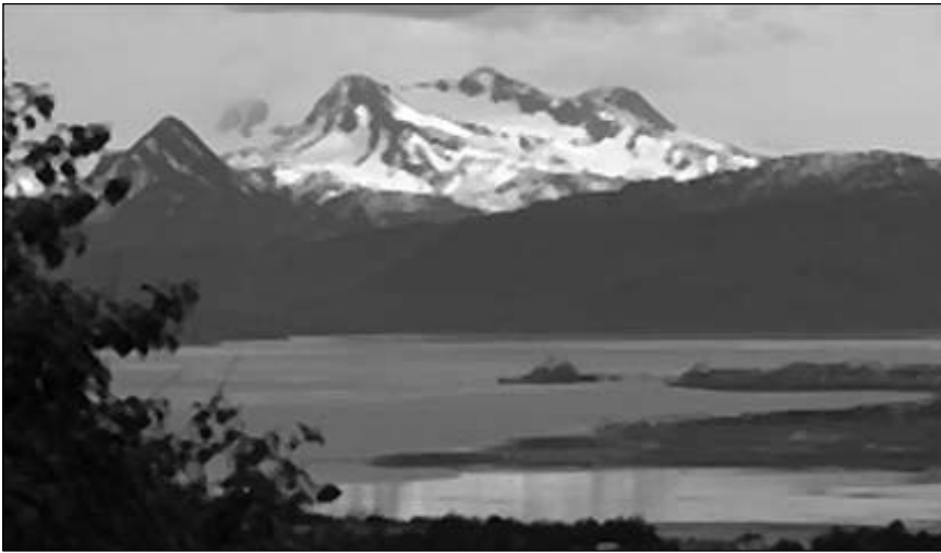
Figure 2. Authentic Alaskan bay.

framework and developing tasks that would allow us to elicit evidence that students are identifying a problem, using data to provide evidence, and interpreting evidence.