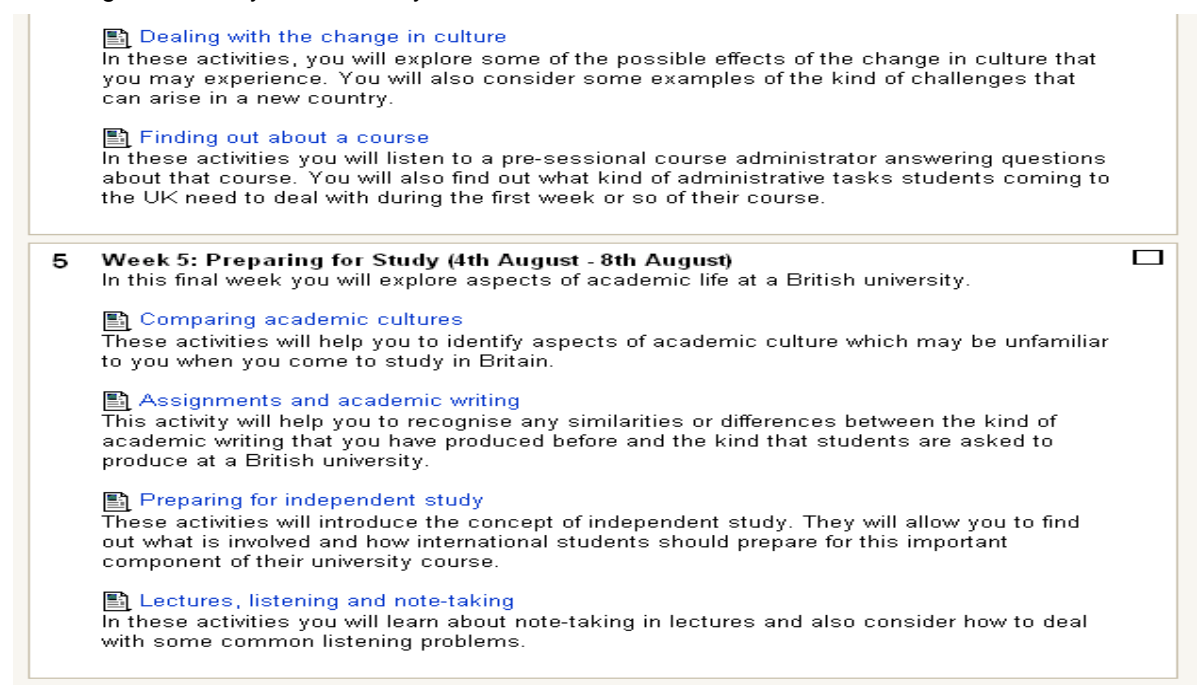
Figure 1: Scaffolding added in the VLE embeds re-used LOs in a new context of use

Besides highlighting the prerequisites for reusability, the development of the EAP Toolkit also allowed important pedagogic features shared by our LOs to emerge and be more clearly defined.