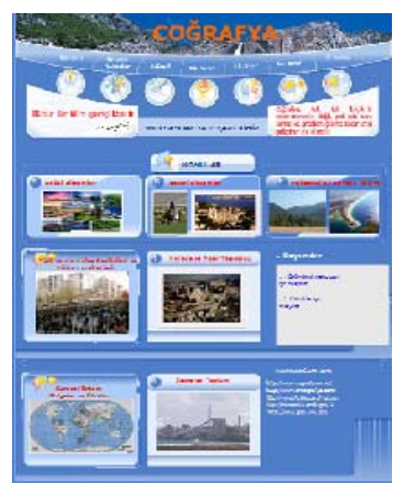
Figure 1: Unit Introduction Page

The announcements section includes questions for students, activity assignments, and other announcements concerning the application.