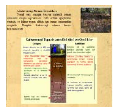
Figure 3: Presentation Page