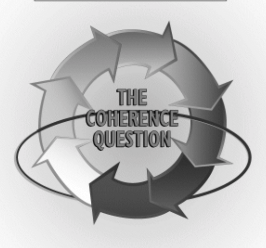
Figure 2 Multicultural Teacher Education: The Coherence Question

to social justice feel like lone rangers in a larger struggle (Gallavan, 2000). In addition, faculty members within the same teacher preparation programs tend to have quite different ideas about what "multicultural" perspectives on teaching and teacher education are and how important they are, so even when these diversity perspectives are infused through a curriculum (by fiat or otherwise), they may not be coherent.