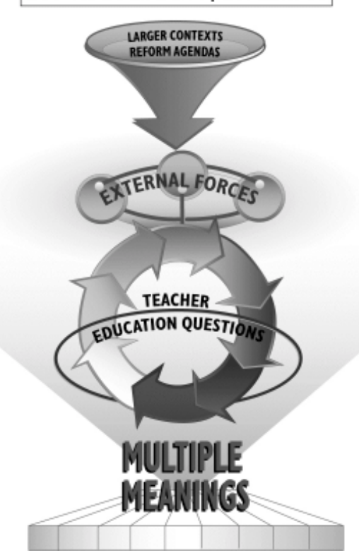
Figure 5 The Multiple Meanings of Multicultural Teacher Education: A Conceptual Framework

There are certainly some exemplary local programs along these lines, and a number of individual teacher educators are strongly committed to preparing teachers for a diverse society. However, the "new multicultural teacher education" envisioned by the theorists does not seem to be in place, at least if we judge by the research about the practice of teacher education. A framework that uncovers differences between theory and practice helps to explain why teacher education programs report they have integrated multicultural perspectives and external reviews conclude little has changed.