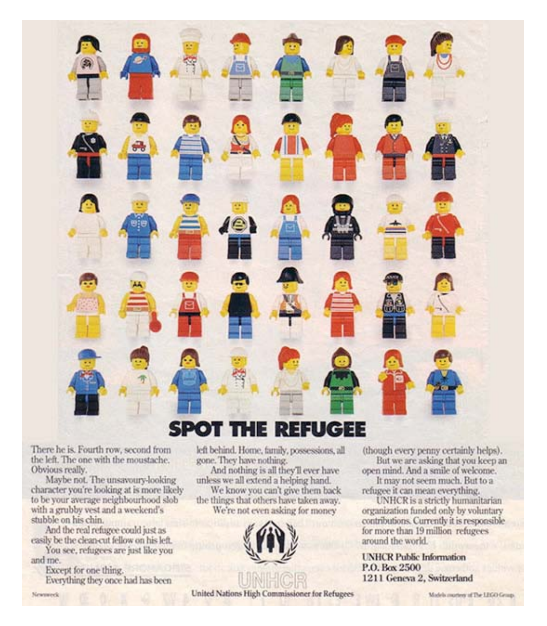
Figure 3. UNHCR Poster

The unsavoury looking character you're looking at is more likely to be your average neighbourhood slob with a grubby vest and a weekend's stubble on his chin. And the real refugee could just as easily be the clean-cut fellow on his left.