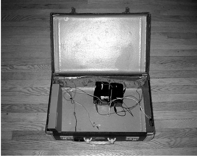
Suitcase Detail, Little Breeze