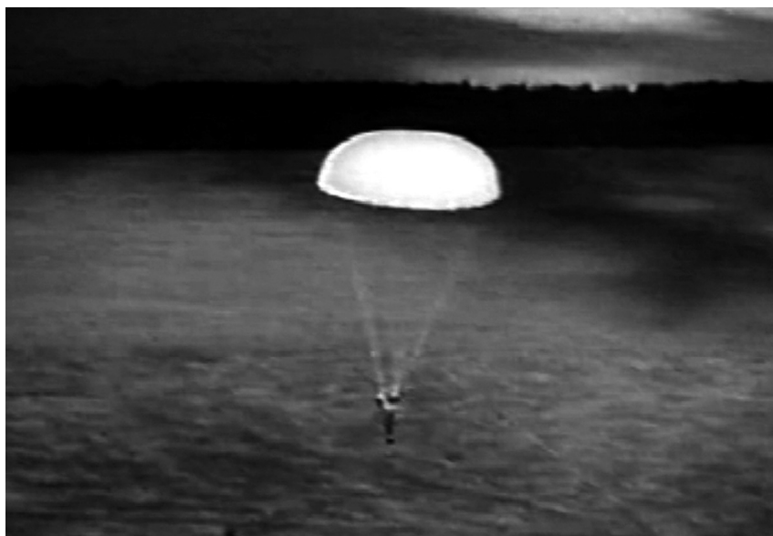
Study for Thin Air , 2007

One of several works in Thin Air is a regulation size, 24-foot diameter, custom-built parachute inflated by fans that turn on and off every few minutes. The inflation of the parachute, and its deflation, are slow yet evocative kinetic events. Sound and silence are important dimensions of the work as the loud fans turn on and off.