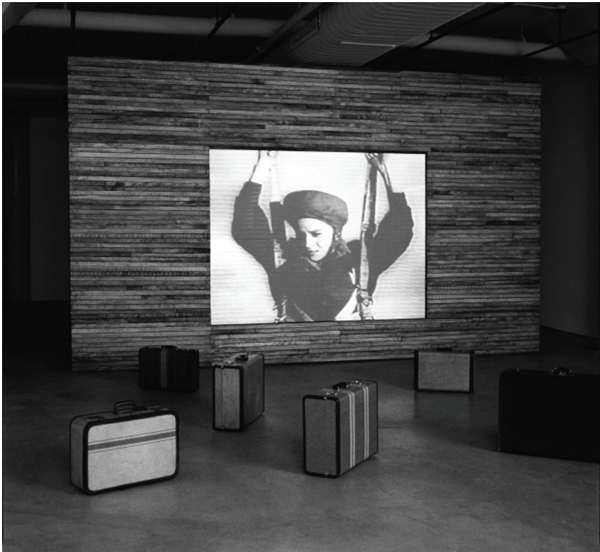
Installation View, Little Breeze , 2004