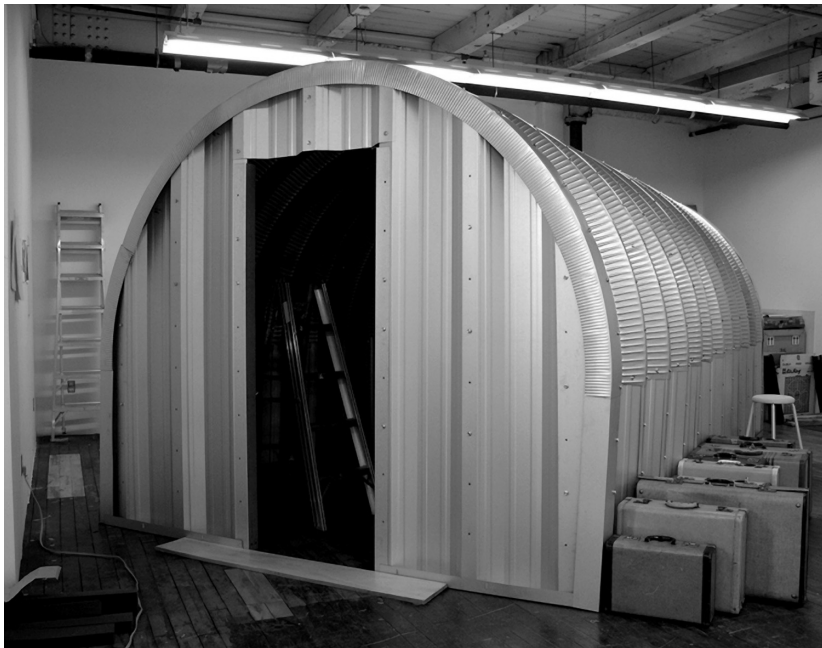
Quonset Hut Assembly, artist's studio, 2007

A third work intended to unite the two other works is a black and white video listing the dates of the full moon during the war. Flying on either side of the full moon was essential for the transport of agents into occupied countries. As Vera Atkins states in one of the audio clips, "We were very much governed by the moon...moon periods... the time when people were dropped."