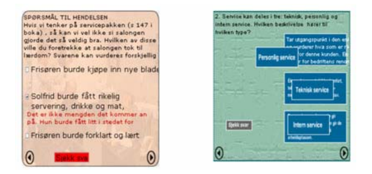
Figure 4. Screen shots from the PDA of multi-media multiple-choice question and 'drag-and-drop' assignment.

It was clear during internal testing that the solutions functioned according to expectations; they allowed all students in the course, irrespective if they were mobile or tied to a desktop computer, to participate and communicate in the same course. However, because additional materials had to be developed specifically for the mobile learners, we found that these solutions could never be applied cost-effectively on a large scale.