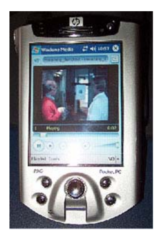
Figure 5. Video on the PDA