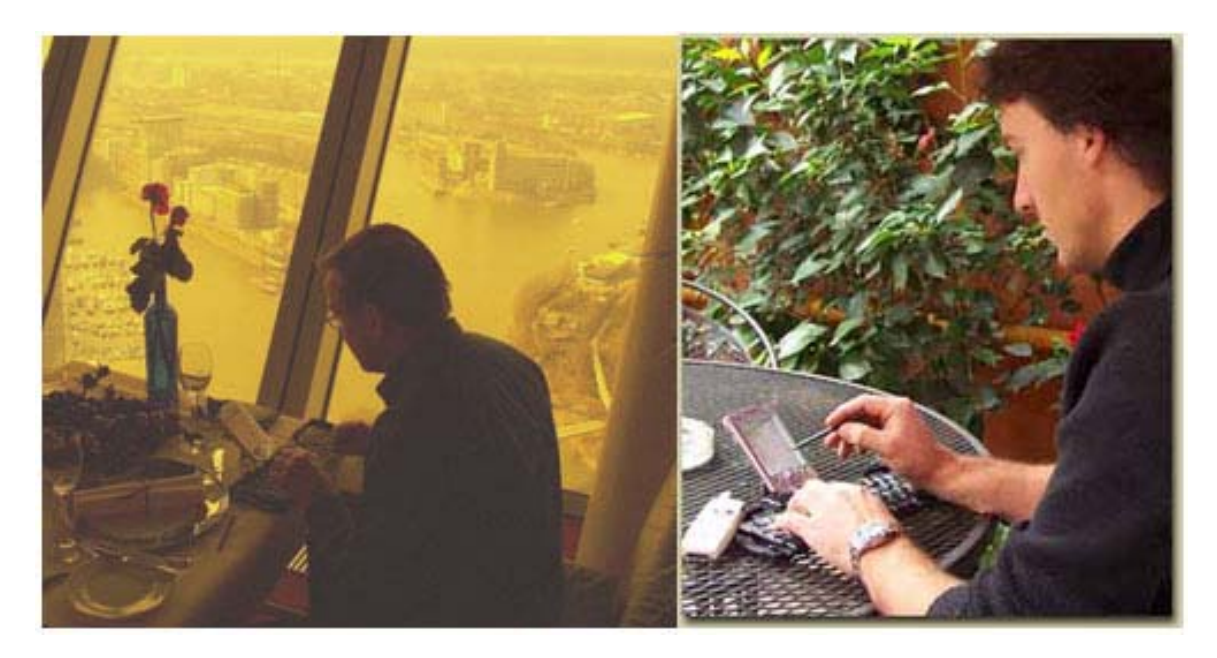
Figure 2. The picture on the left shows a tutor 'on the move,' writing and sending emails to his students from Düsseldorf 'Himmelturm.' The next picture is of a student on holiday communicating from the garden of his hotel in Rome.