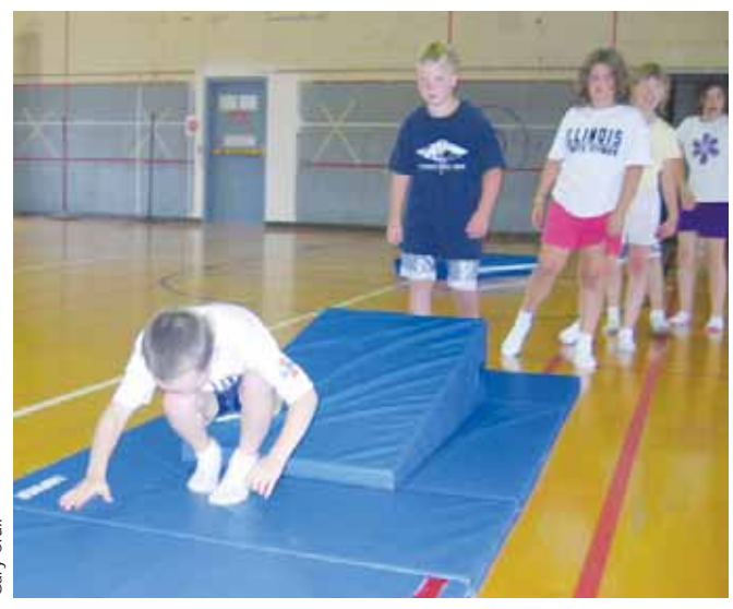
Performing in front of classmates often creates negative stress in physical education students.

soccer rules, or a team working together during sport education to come up with a practice plan and game strategies. However, simply perceiving that the demands of a situation outweigh a student's capabilities and resources does not necessarily produce stress. Stress results only if the student is worried about failing. So even though the student getting ready to perform the PACER test may not believe that she has the ability to perform well on it, she may not experience stress if she does not care how she performs.