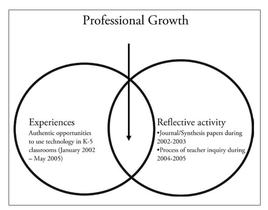
Figure 3. Experience + Reflective activity = Professional growth (Posner, 2005).

1. What are the tangible results when prospective teachers participate in the curriculum-based, technology-enhanced field experiences under study?