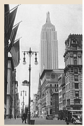
The Empire State Building