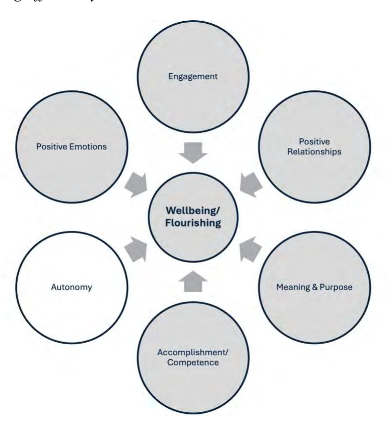
Figure 2 Domains of Wellbeing Affected by TL

In the research reviewed, several aspects of wellbeing appeared to be affected by engagement in teacher TL. There was evidence that all aspects of the PERMA model posited by Seligman (2011) could be affected. Additionally, autonomy, a key area of psychological wellbeing (Ryff, 1989), also emerged. Consideration of these links are important if we wish to support and retain teacher leaders.