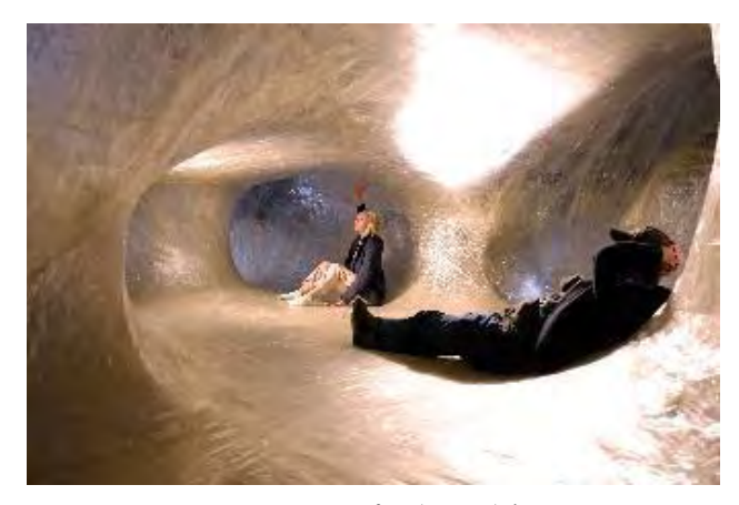
Figure 5. Tape Wanås (2022) by Numen.

Note. Wanås Konst Sculpture Park, Sweden. (Jonke et al., 2022).