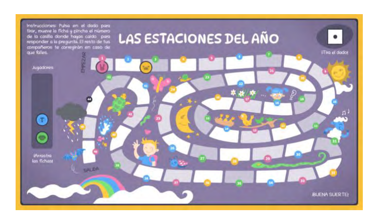
Figure 11. Complementary Educational Material.

In addition to designs of installations based on a model, students created complementary educational material. For example, the "seasons of the year" group included an activity and game to complement the installation (Figure 11). They also created a visual map of the material used (Figure 12), which is the result of having completed an activity I designed to support this project, Annex: Evaluation and reflection on the project: Installation , which can be accessed through the link in the reference list (see Marqués, 2023b).