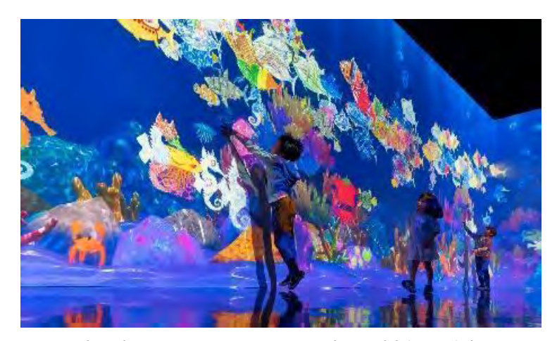
Figure 1. Sketch Aquarium: Connected World (2021) by teamLab.

An installation designed for children to interact with sculptural forms of food. It is a good example for future teachers to discover a new way of presenting everyday objects to children. The Wobbleland model is a useful resource for students to see a three-dimensional prototype before its construction in a museum.