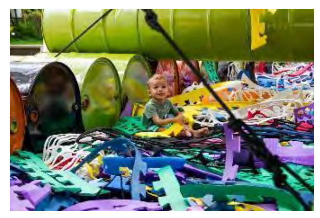
Figure 4. City for Children Under 99 years Old (2016) by Basurama.