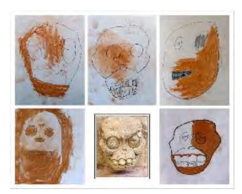
Figure 3. The Bombearte Project (2015–2022) by Marín & Roldán (2021).

An installation made from biodegradable tape, featuring a structure formed by organic shapes that can be walked through and a composition resembling biomorphic architecture, constructed as a network with a sculptural membrane.