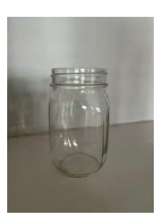
Figure 4 The Theme of Exhaustion

Each of the three themes are independent yet are also interconnected as one theme feeds into the next and the next. The core of these themes is exhaustion. At first, the participants acknowledged the importance of problem solving and quickly discovered their inability to "solve" these pandemic problems. Then participants experienced emotional brutality— essentially feeling as if they were the "punching bag" for all that was wrong with education and the pandemic. Finally, the participants accepted the exhaustion they felt. Participants contributed valuable recommendations that are further addressed in the discussion of the findings.