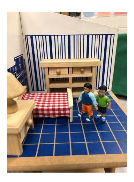
Figure 2 The Theme of Problem Solving

The photograph is of a child's dollhouse. The dollhouse has a blue checkered floor with a brown, wooden edge and a blue and white pinstriped wall. In the dollhouse are two figurines— both figurines look like male children. The childlike figurines are placed in a standing position at the foot end of a figurine of bed. The bed figurine has a red checkered blanket. There is a brown wooden table and lamp figurine and a small bureau figurine in the photograph as well.