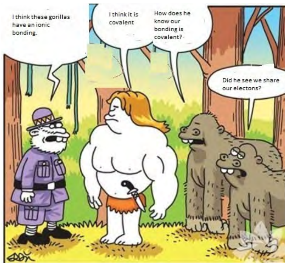
Figure 1: An example concept cartoon used in the experimental group.

Concept cartoons were created by the researcher and the figures were taken from internet websites, then the dialogue parts were written by the researcher. After that concept cartoons were examined how they fit with this study by four chemistry education experts.