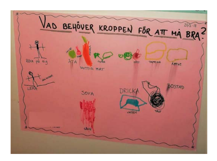
Figure 1. What do our bodies need to be healthy?

People's health. The teachers initiated activities by asking the children, " What do our bodies need to be healthy? " (Figure 1). The children answered, " Our bodies need food ," " We have to play ice-hockey ," " We need clean air and oxygen ," " We should drink lemonade and water ,"