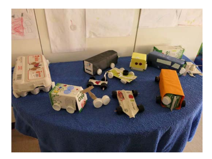
Figure 4. Handmade toy cars

The children made toy cars out of empty milk packets, egg packets, plastic lids, and old paper, and then colored their handmade toy cars with pens (see Figure 4). In most cases, the children talked about what they could do to help the earth be healthy, and they also wanted to take responsibility as a step toward making the earth a better place to live.