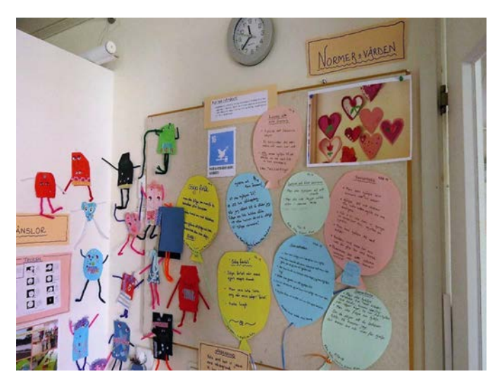
Figure 6. Norms and values in humans' society