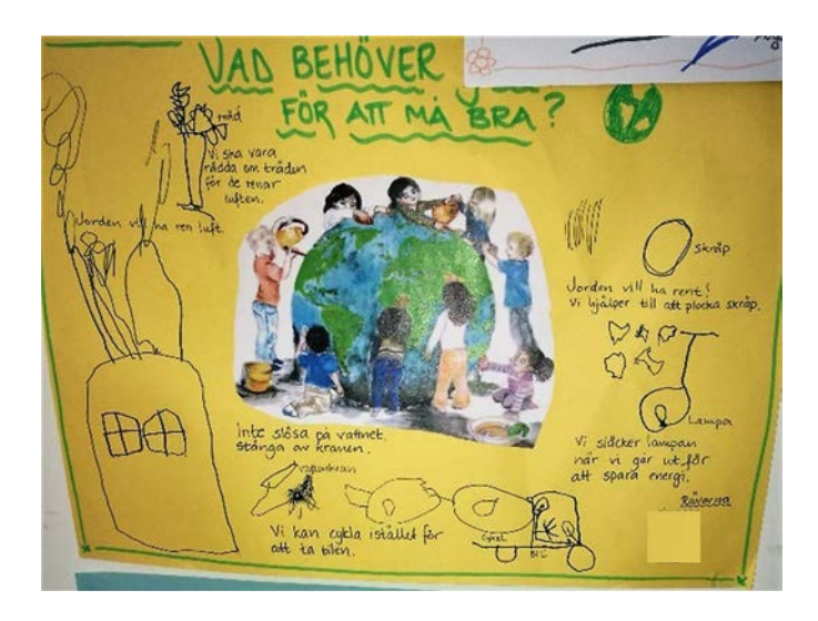
Figure 2. What does the earth need to be healthy?

According to the children, "We need trees to keep the earth healthy. We should take care of trees because they clean the air. The earth wants clean air." Other responses were: "The earth wants to be clean. We can help the earth be clean by picking up litter," "We can ride cycle instead of taking cars to reduce pollution," "We should not waste water. We must turn off the tap and switch off lights when we go out to save energy." Some children wanted to help the earth by "buying food that is grown in Sweden and in local places" (the name of the municipality is deleted in the illustration for the sake of anonymity) and by "recycling."