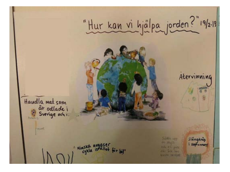
Figure 3. How can we help the earth?