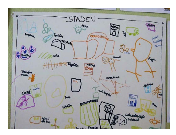
Figure 5. What does our town have?

The children were aware of the facilities they have in their community – for instance, the supermarket where they buy food, healthcare centres, hospitals, fire brigade, police station, bus stop, train station, preschool, school, etc. They worked individually as well as in groups. (Marit, preschool teacher)