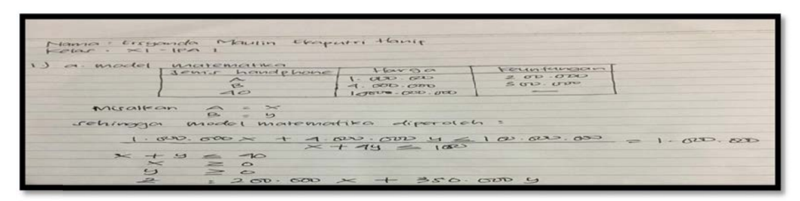
Figure 1. Student work results T1

Based on the work of T1 students, it can be explained that T1 students can connect previous knowledge about linear inequalities material with contextual problems so that they can make mathematical models and formulate objective functions as the completion of linear programs. Student T1 makes an auxiliary table by assuming that x is a cellphone of type A and y is a cellphone of type B, as a way of obtaining two inequalities and an objective function. But in the results of the interviews the students felt difficulties in making an example of the word problem to get a mathematical model, student T1 said that it was necessary to be careful to change the story problem into a mathematical model. The accuracy referred to by T1 students is that if a story problem is wrong in making a mathematical model, for example, an inequality sign error is less than equal to ( \leq ) and more than equal to ( \geq ), errors in making examples, and errors in formulating mathematical models, then the next step it's already wrong because it's already had an error before.