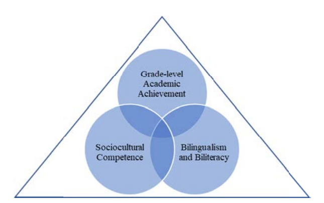
Figure 1. Three goals for bilingual education (Garcia, 2011)

However, the goals and strategies of bilingual education programs may vary (Christian, 2016). Some models prioritize language acquisition, while others (e.g., dual language education programs) aim for academic success in both languages (Howard et al., 2003). The classification of dual language education programs in the US includes one-way immersion, two-way immersion, and foreign/world language immersion, each catering to diverse language learning needs (Howard et al., 2018). Dual language education programs are crucial in achieving grade-level academic success, bilingualism, biliteracy, and sociocultural competence as they improve academic outcomes, enhance cognitive development, and increase social and cultural capital (Christian, 2011, 2016; Howard et al., 2018). Sustained and consistent dual language education is vital for promoting students' language proficiency and academic achievement in the long run (Howard et al., 2018; Steele et al., 2017; Umansky & Reardon, 2014). Despite the success of these programs, challenges persist in coordinating the curriculum and instruction across two languages (Howard et al., 2018; Murphy, 2016).