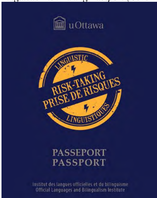
Linguistic Risk-Taking Passport (Cover Page)

The Passport currently contains over 80 such risks that range from using the second language at the library, cafeteria, or sport services, to applying for a job, speaking to a superior, singing karaoke, or submitting an academic assignment in the second language (i.e., foregoing the right to submit an assignment in the first language). The Passport exists in equivalent versions in French and English, and participants are given the version in the target language they are learning. Explanations of the construct of a linguistic risk and why it is important to take risks in language learning are included. Most risks can be repeated up to three times, which offers learners opportunities for repeated exposure to similar situations or tasks. Learners use the Passports autonomously, outside of class time as a motivational, strategic, and record-keeping tool in their daily language practice. They can choose which risks are appropriate or interesting for them and check them off in the Passport once taken. In addition, learners are asked to indicate whether they perceived each risk as High, Medium, or Low at the time they took it. Sample risks are provided in Figure 2, which represents a page from the main section of the Passport for an English learner (the risks for a French learner are equivalent).