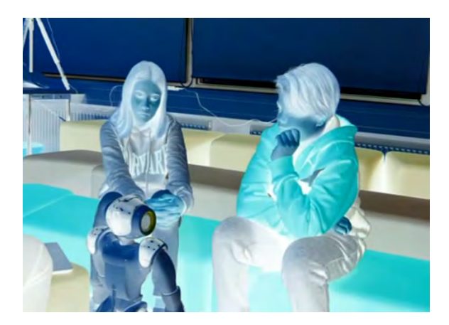
Figure 1 The Setup of the Group Discussions with the Robot.

As in many previous studies (see Randall, 2019; van den Berghe et al. , 2019), the data for the present study were gathered in a single session and consisted of video recordings (90 minutes) of robot-assisted language learning in the classroom for one day. To provide all the children with the possibility to interact, they were divided into small groups (2–4 children per group, henceforth C1–C4). The same teacher was present in all group discussions. She was a visiting language teacher and not the group's regular teacher. Altogether, six group discussions were analysed for this article, with an approximate duration of 15 minutes each (see Figure 1).