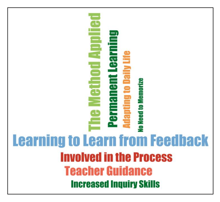
Figure 1. Code Cloud.

ance (TG), Involving with the Process (IP), and Permanent Learning (PL) codes had the second highest frequency.