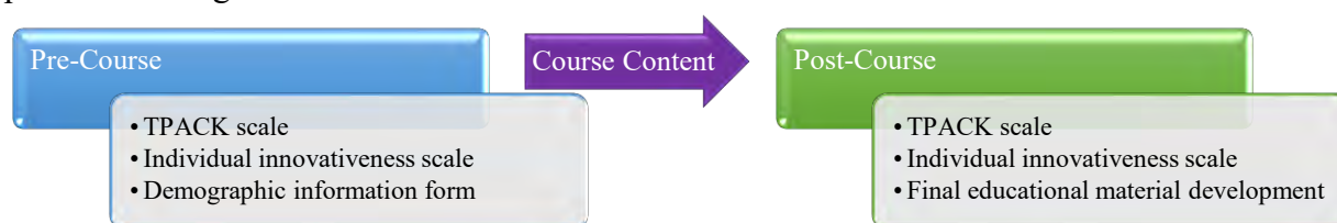
Figure 1: Research design

A quasi-experimental design model was used in this study. The quasi-experimental design is preferred due to the non-randomized assignment of the participants to ensure the internal validity of the study (Fraenkel et al., 2012). The research design of the study is presented in Figure 1.