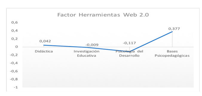
Marginal Averages of the Different Courses for the Factor: Web Tools 2.0