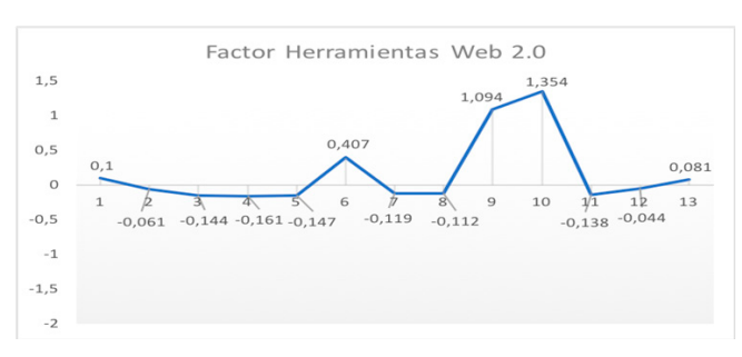
Figure 7. Marginal Averages of the Different Teachers for the Factor: Web Tools 2.0

These results indicate that very few teachers make use of different technological tools (chats, blogs, forums, etc.) to increase communication with their students. However, two teachers (9 and 10) stand out favorably for their use of these tools compared to the other teachers, suggesting a greater skill and ability in the use of information and communications technologies. The mean scores for the Web Tools 2.0 factor for the 13 teachers analyzed are shown in Figure 7.