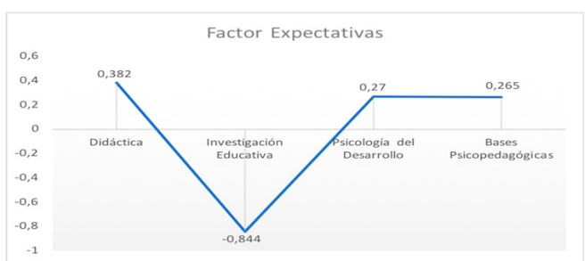
Figure 1. Marginal Averages of the Different Courses for the Factor: Expectations

courses (F(3, 365) = 1.42; p > 0.05; \eta^2 = 0.01 ). Thus, we can affirm that this factor does not depend on the course subject, given that all courses use the same platform with the availability of the Web Tools 2.0. The mean scores for the Web Tools 2.0 factor for the different course subjects are shown in Figure 2.