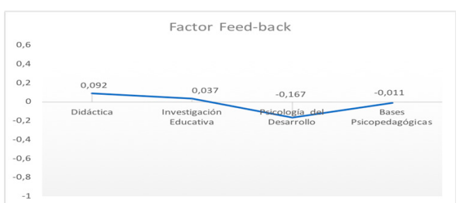
Figure 3. Marginal Averages of the Different Courses for the Factor: Feedback

Learning showed a significant effect depending on the subject matter of the course (F(3, 365) = 9.56; p < 0.001; \eta^2 = 0.07 ). The multiple comparison tests showed statistically significant differences (p < 0.01) between Didactics and Education Research and Psychology of Education, the former being the course with the least amount of cooperative/collaborative group work.