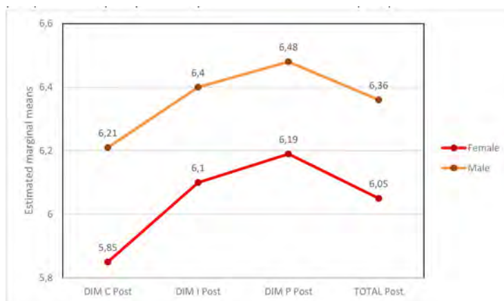
Figure 3. Post-test descriptive statistics according to the gender variable and time of evaluation

Specifically, in the communicative dimension, a quite positive evaluation was achieved for both genders (male, M = 6.21 ; female, M = 5.81 ), despite being the lowest-rated dimension, generating significant differences ( U = 6795 ; Z = -4.697 ; p < .05 ) with a small effect size ( r = .309 ). Regarding the intellectual dimension, the male participants evaluated the possibilities of gamification quite positively after using the methodology ( M = 6.40 ), with a higher mean score than the female participants ( M = 6.10 ), significant differences ( U = 6731 ; Z = -4.794 ; p < .05 ), and a small effect size ( r = .278 ). The pedagogical dimension was again rated the highest by both genders, with male participants giving evaluations close to very positive ( M = 6.48 ), while those of their female counterparts were quite positive ( M = 6.19 ), yielding significant differences between the two genders ( U = 7056 ; Z = -4.339 ; p < .05 ) with a small effect size ( r = .283 ). With regard to the overall score of the questionnaire, the perceptions of both genders were quite positive (male, M = 6.36 ; female, M = 6.05 ), producing significant differences in the scores ( U = 6354 ; Z = -5.302 ; p < .05 ) and a small effect size ( r = .353 ).