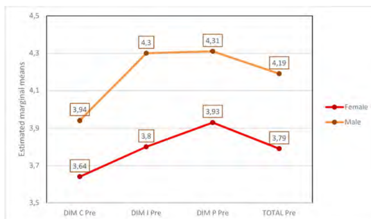
Figure 2. Pre-test descriptive statistics according to the gender variable and time of evaluation

With respect to the post-test evaluations (Figure 3), the scores in all dimensions reflected higher perceptions in male participants in comparison to those found in female participants.