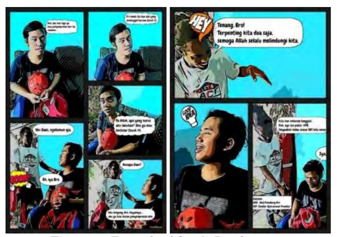
Figure 2: Example of Comic Development.