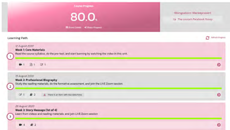
Figure 2 Learning Path—a learning tracking system available on CHULA MOOC

The rationale for integrating MOOC-based blended learning in this study is rooted in the advantages offered by the CHULA MOOC platform, particularly its learning tracker. CHULA MOOC provides a learning progress tracker, known as a learning path, presenting a significant advantage by enabling students to track their progress through the course. In the present study, the learning path did not only track progress; it also provided constructive pathways that helped students navigate their learning. The learning path gave students a weekly lesson plan, including pre-class activities like videos, readings, and quizzes, all represented by easy-to-understand universal icons. This structured guidance was crucial in the blended learning environment, ensuring that students were aware of their learning plan and would be able to follow it easily.