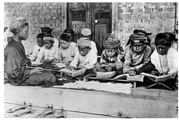
Figure 1 Students studying at Pesantren on Java Island

In the thirteenth century, Islamic traders began to influence the color of education in Indonesia until Islam became a religion that dominated the Indonesian archipelago. Islam developed a mass education system, namely pesantren (see Figure 1), emphasizing the doctrine of Islam and the Islamic way of life (Hicks & Peacock, 1973). The influence of Christianity entered the Maluku region in the sixteenth century. The Christian religion strengthens the local population's literacy by teaching mathematics, science, reading, and writing (Bjork, 2005).