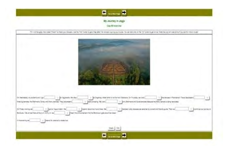
Figure 1. The display of the first exercise