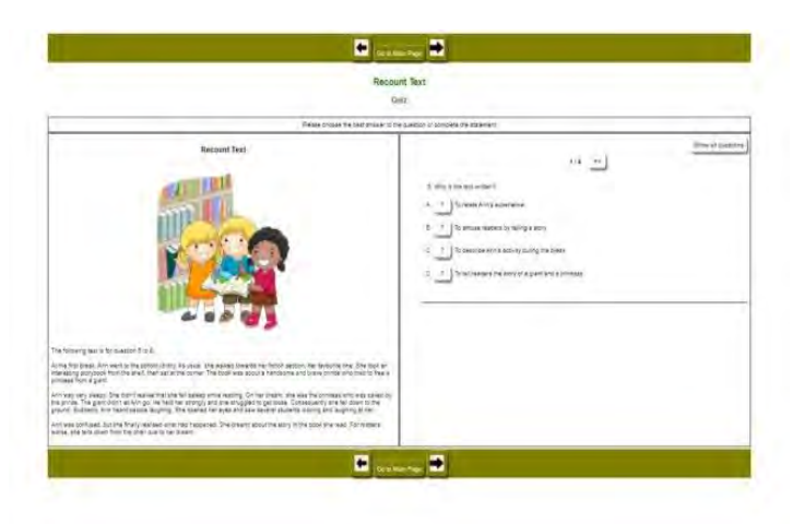
Figure 3. The display of the third exercise

The second and third exercises are in the form of multiple choice. There are four questions in each exercise. The students are required to choose the best answer based on the text given on the left side. After choosing the answer, there will be information shown in the exercise, showing whether their choice is correct or not, represented by certain emoticons.