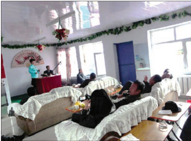
Figure 2. Singing of Dongbei Dagū in the tea house