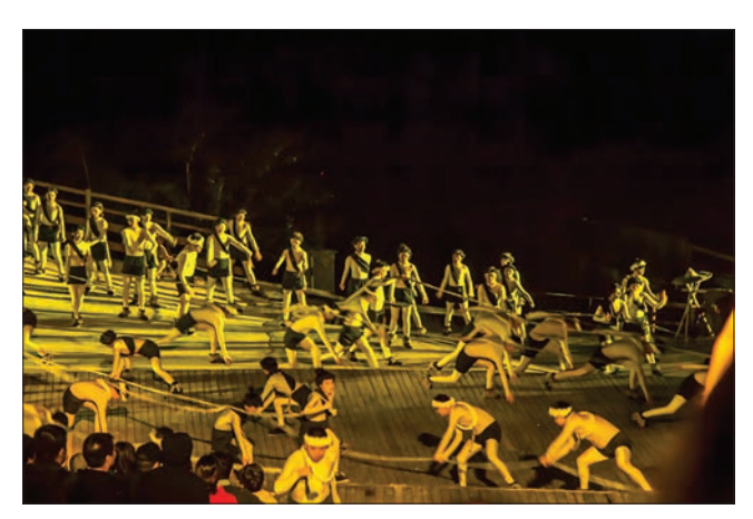
Figure 2. The impression wulong performance

The play was characterized by audience participation, with singing and physical interaction between actors and