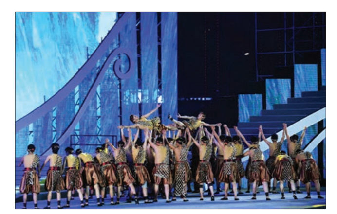
Figure 3. The song of the great river performance

viewers. This interactive aspect deepened the audience's understanding of Chuanjiang Haozi, allowing them to experience the struggles and determination of boatmen and trackers. The play maintained the authenticity of intangible cultural heritage while incorporating modern elements like choreography, lighting, and multimedia technology to recreate the boatmen's lives and their fight against nature.