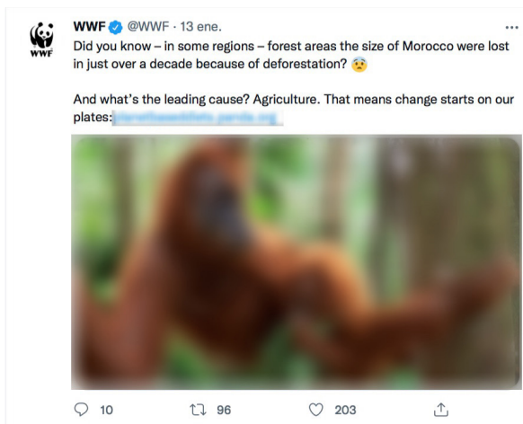
Figure 2. WWF's Tweet on Deforestation

Considering the similarities concerning written comprehension, it could be argued that bringing into the classroom those reading practices that EFL students typically carry out outside—such as consuming tweets—