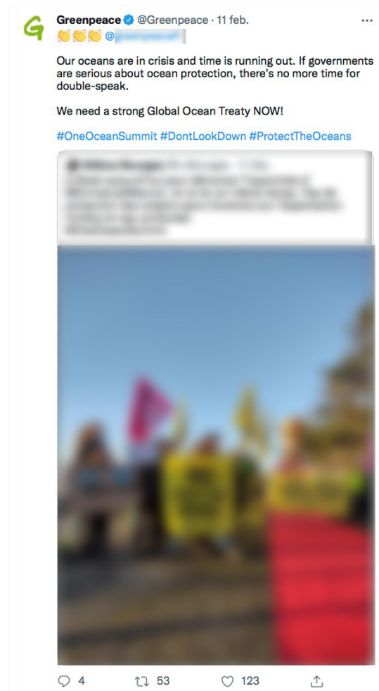
Figure 3. Greenpeace's Tweet About Ocean Protection

could teach them how to read more comprehensively and become competent internet users. This latter idea of educating competent users relates to the curricular requirement of fostering students' digital competence by teaching them how to filter information in the digital net. This translates into making students aware, first, of their exploitation of digital affordances such as hashtags as information sources and, second, of the risks of not using these digital means critically, thus contributing to developing critical thinking skills.