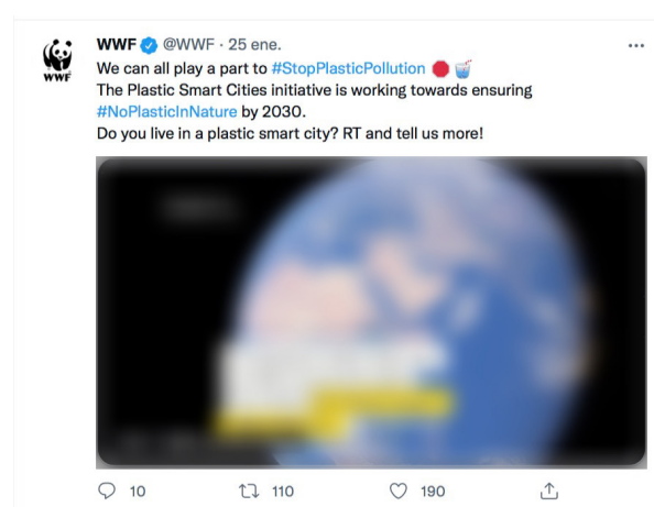
Figure 5. WWF’s Tweet on Plastic Smart Cities

In the case of Figure 5, the video included has no sound and, therefore, could not be specifically used to practice listening skills. However, many other tweets containing videos with music and oral explanations could become the object of listening activities. Students could be asked to watch the video and orally comment on it to practise listening and speaking or to answer a series of written questions about the clip to practice writing. Apart from this, as multimodal ensembles themselves, some videos also contain examples of the gestural mode, which express significant paralinguistic meanings that students need to be aware of according to curricular demands. Similarly, these videos make very innovative use of spacing and visual elements such as colours, as in Figure 5, in which WWF probably avoids