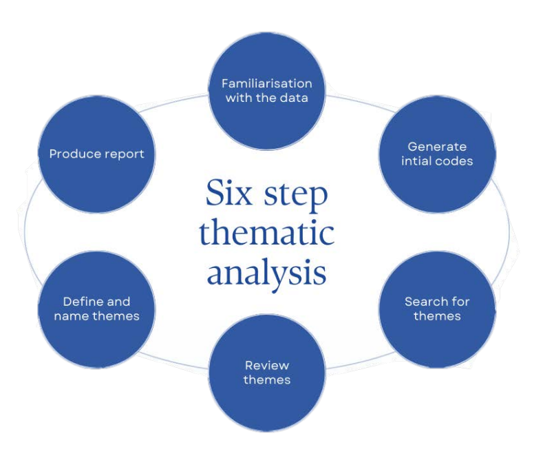
Figure 1. Six step thematic analysis

The data sets for this study were analysed in three stages: first, analysis of data from the semi-structured interviews, second, analysis of the images of artifacts with their corresponding audio recordings, and third, an analysis of the school policy documents. Thematic analysis of all data sets began with familiarisation of the data and generation of the initial codes or themes. Once some themes had been identified, an investigation of the data for similar themes took place. A review of those themes occurred next. Finally, the themes were refined with the addition of subthemes and the findings presented.