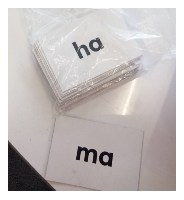
Figure 3. Kūoro (syllable) cards

Another key element of literacy success is syllable awareness. Cowen (2016) maintains that syllable awareness is one of the six key elements of literacy success. Evidence from physical artifacts in the classroom and teaching resources demonstrate that SL helps kaiako to support students with their syllable awareness. Tia explained that she used the syllable cards (Figure 3) during her literacy instruction to teach students syllable awareness skills.