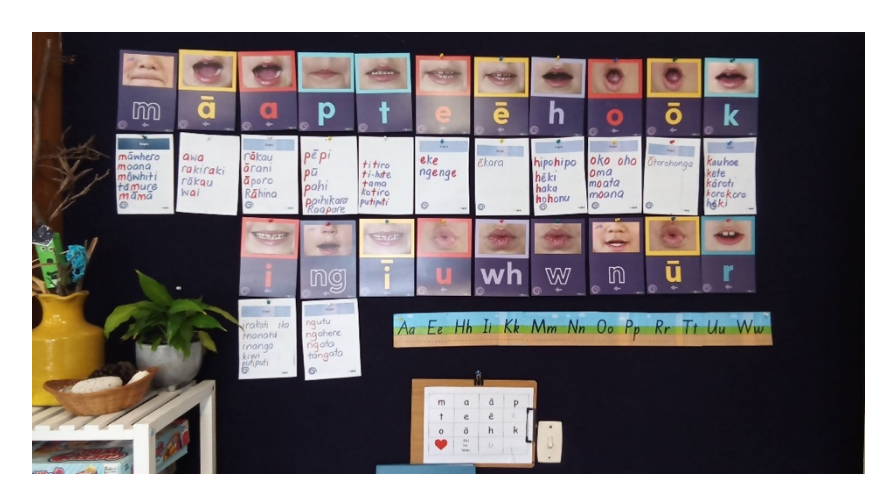
Figure 2. Sound wall display

During the interviews, kaiako often referred to some of the key elements of literacy learning and how they are incorporated in their instructional practices. There was also evidence of these elements in their classrooms, such as the wall displays, the teaching resources, and samples from students' work. One example of the literacy elements being used in the classroom is the sound wall (Figure 2).