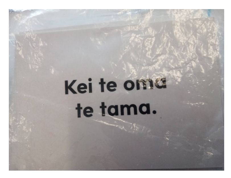
Figure 4. Rerenga kōrero (sentence) cards

Tia gave students a starter sentence such as, "kei te haere a māmā ki te toa (mum is going to the store)" and provided students with a conjunction to use such as, "although". Students were then asked to write a subordinate clause which connects with the main clause to create a sentence in te reo Māori. Tia affirmed that her training in SL helped her to understand how to teach syntactic knowledge to students, whereas prior to the PLD she "wasn't always sure how to implement it". These results indicate that PLD in SL can support kaiako to effectively aid the development of syntactic awareness, a necessary skill for literacy success.