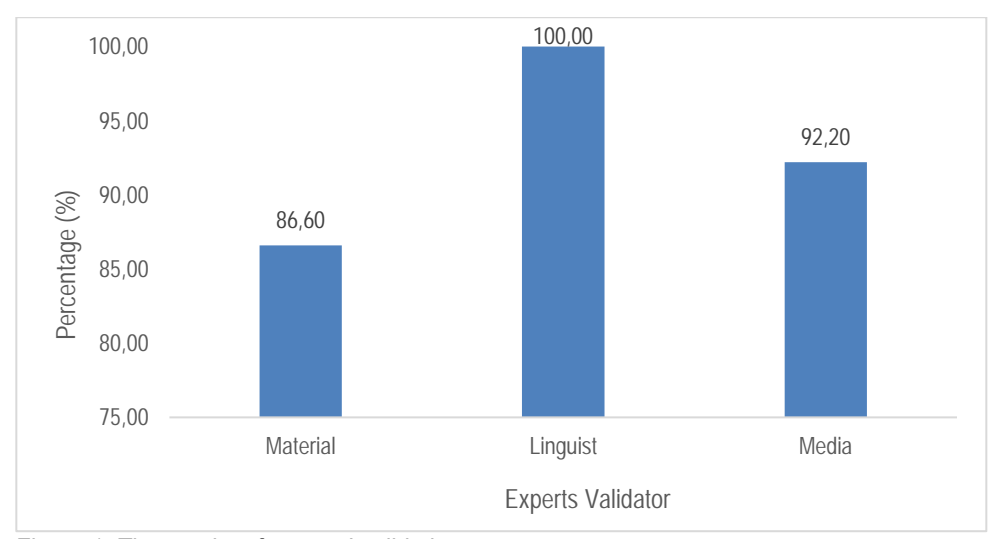
Figure 1. The results of experts' validation

The results of material, language and media experts' assessments of STEM-based chart media are as explained in Figure 1. The results of the experts' assessments show a percentage above 85%. In other words, the charts developed are very suitable for use as learning media in schools. The practicality test results also show that STEM-based chart media received an assessment percentage above 90.00%, both from teacher assessments (94.00%) and student assessments (92.06%). The results of the product practicality test are as described in Figure 2.