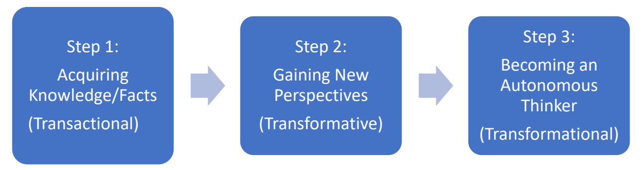
Figure 1. Transformational Learning Progression Model

Step 1 is transactional learning, which is particularly relevant for educating children who must learn information before they can begin to understand how to apply that information. It is also very appropriate for teaching/educating adults when the focus is on technical, analytical, and/or process training (Mezirow, 1997).