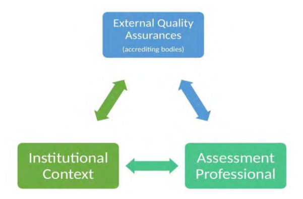
Figure 3 Relationship Consideration in Assessment Role

Our last recommendation concerns further defining what roles and skills are needed to be effective assessment professionals. The development of a capacity-building toolkit is suggested that will guide colleges and universities in defining their assessment needs and structuring resources for effective and meaningful assessment. Experts in the field of leadership and organizational development, like Adrianna Kezar (2018), have written extensively on how institutional representatives can identify roadblocks within institutions, organize themselves to build capacity, and enact change. These works do not provide a toolkit for institutions to use that is dedicated purely to assessment, which may explain why there continues to be such a broad array of job titles, functions, and reporting structures for assessment at colleges and universities. We propose a capacity-building toolkit that has more than one purpose and includes an inventory for identifying assessment needs at the institution, steps to set up an office that supports key assessment functions, and guidance on developing job descriptions for hiring key staff, like the assessment leader. The toolkit should also include criteria for further development of assessment professionals as leaders of assessment and beyond.