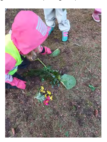
Figure 3: Land art with leaves, flowers and spruces.

The purpose of the workshop assignments in the orientation phase was to strengthen the children's multisensory observations. They were scaffolded on producing land art and created free-themed land art in small groups. These land art pieces were accompanied by storying, in which the children were asked to collaboratively related what they had created and imagine the meaning of the land art (see Figure 3).