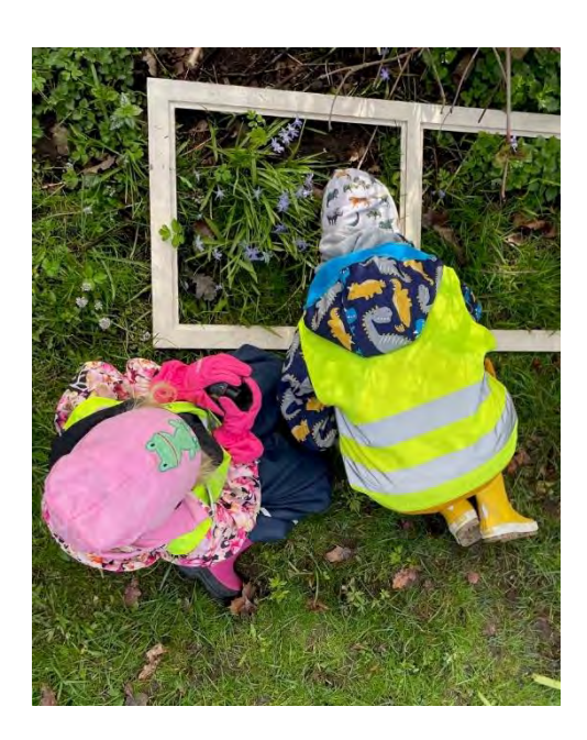
Figure 2: The intensive study of forms and colors in the garden.

The purpose of the workshop assignments in the orientation phase was to strengthen the children's multisensory observations. They were scaffolded on producing land art and created free-themed land art in small groups. These land art pieces were accompanied by storying, in which the children were asked to collaboratively related what they had created and imagine the meaning of the land art (see Figure 3).