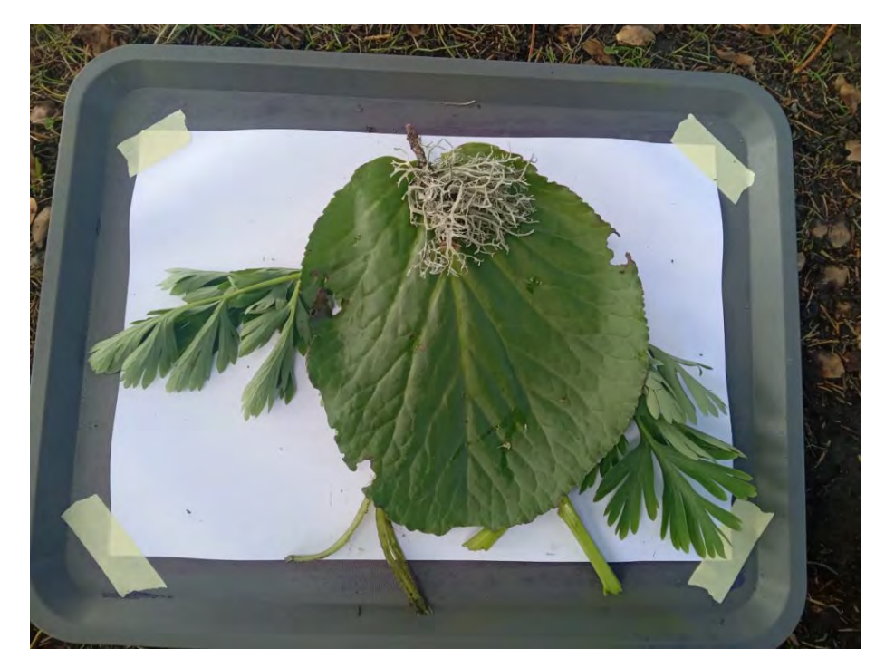
Figure 4: "Eagle," implemented by C5.

All the children created their own pieces of land art and assigned names to their land art characters (Table 1). The land art activity produced a diverse range of characters, with inspiration coming from different sources: nature itself, children's imaginations, and a fusion of nature and imagination. A few children's land art pieces (n = 3) were inspired by natural elements like animals or plants. For example, one child wanted to create an eagle, and the resulting piece of land art was brought to fruition through the use of a wide range of natural elements such as leaves, plant stems, and lichen (see Figure 4).