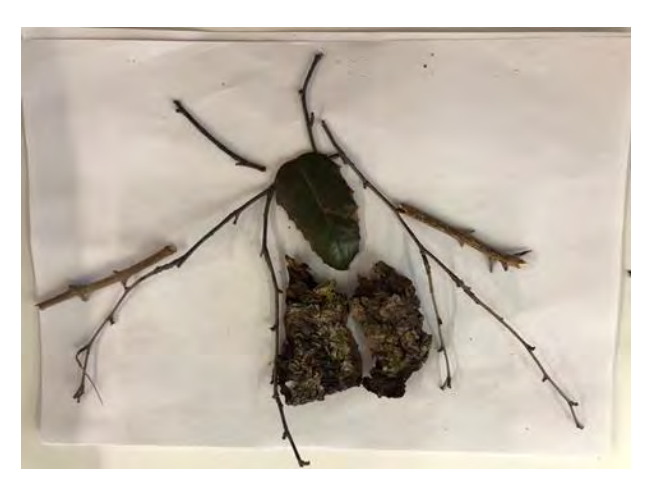
Figure 6: "Nature Protector Bull" by C14.

"The character is powerful and has super armor. It rams with its horns. It can make antidotes if it gets irritated. If it gets angry, it starts to lash out and then the world explodes. It can climb and is a conservationist."