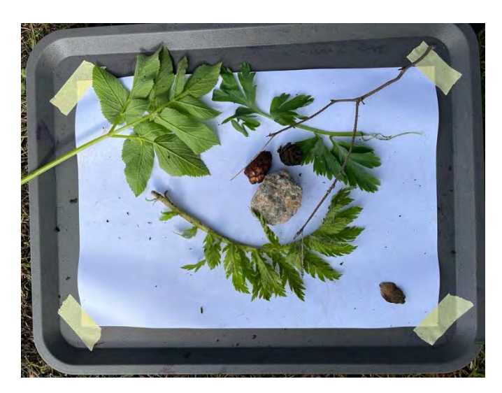
Figure 5: "Horror Man" by C7.

Some of the children's land art pieces (n = 5) were clearly conceived in their imaginations without explicit inspiration from the natural world. These pieces were characterized by the depiction of fictional creatures from popular culture or shapes that were original to each child's individual vision. "Horror Man" featured conifer cones as the character's eyes and a stone as its nose. In the creation of this artwork, the child incorporated leaves to enhance the details of the character's features, including the depiction of its hair and mouth (see Figure 5).