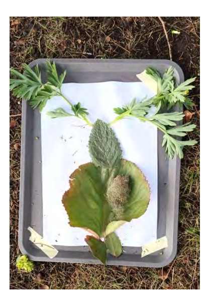
Figure 8: "Bunny" (C16).

arranging natural materials, the children were able to craft intricate details, bringing their characters to life in a way that was both unique and memorable. For instance, leaves with fine, stringy fibers or fringed edges proved to be ideal for crafting hair or tufts of hair for the characters, as the fibers could be arranged to create a realistic, textured effect. Waxy leaves served as the skin or hide of the characters and were also used to shape the body or shield. Small leaves, dry berries, and pebbles were the primary choices for eyes. Similarly, grass with fluffy textures were used to design ears, giving the characters a distinctive and quite charming appearance.