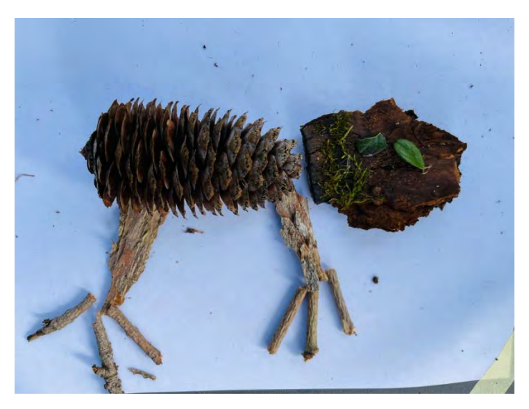
Figure 7: Bird (C15).

In the realm of land art, the creative process involved a form of communication with natural materials that provided inspiration and ideas for the children, while the characters imposed certain demands on the materials chosen. In this way, creating land art can be viewed as a dialogue between children, materials, and characters brought to life through the art form. The use of natural materials such as leaves, twigs, stems of plants, and grass to create unique characters encouraged the children to explore and appreciate the beauty of nature. In this study, the observation that certain natural materials were particularly well suited for specific character features is noteworthy.