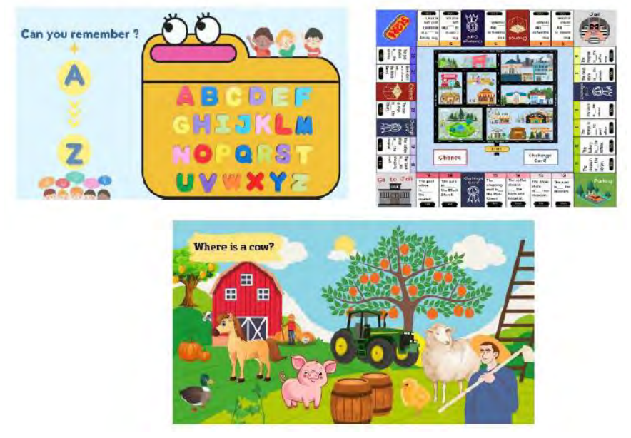
Figure 2. Examples of innovations