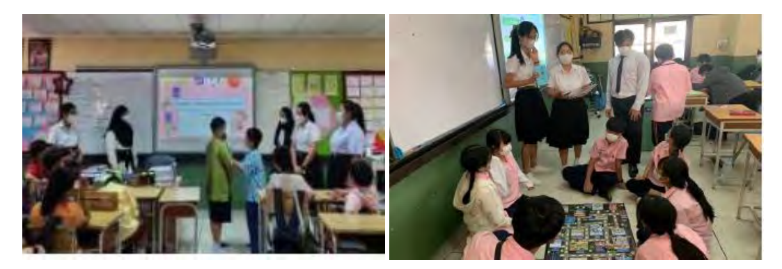
Figure 3. Examples of applying innovations with students at school