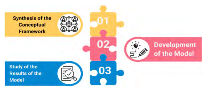
Figure 1. Research methodology

The research methodology designated to design this model is based on the system approach (Khemmani, 2010; Utranan, 1982), which can be divided into 3 stages as shown in Figure 1.