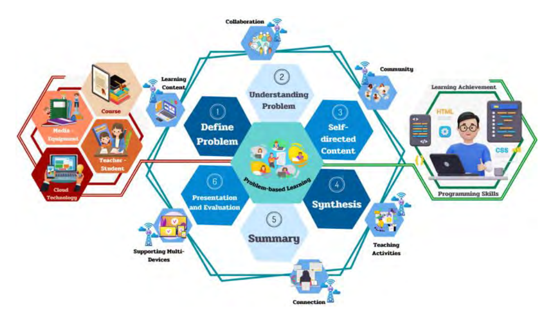
Figure 3. The problem-based learning model: PBL model via cloud technology

Figure 3 represents the PBL model via cloud technology, which includes the following 4 main elements: