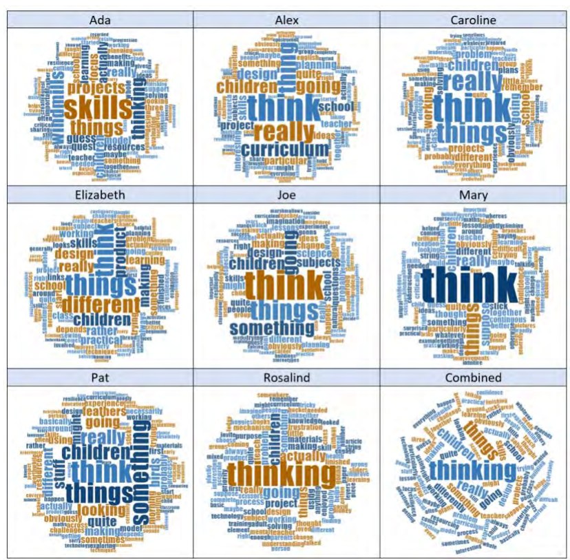
Table 3: Word cloud analysis

Looking at the Combined word cloud, 'thinking' was the key word to come from the transcripts which could possibly be explained by the fact that critical thinking are key words within the study. Whilst one also has to remember that responses in an interview might be 'I think that...', to have the word 'thinking' with the additional suffix implies that an action, product or process is occurring and this pattern emerged throughout each participant's interview. Although not as prominent within Ada's word cloud, 'thinking' is still one of the more commonly used words within the transcript and comes up as a high percentage within every other transcript. Key words of 'design', 'skills' and 'different' also have regular appearances and were considered throughout the thematic analysis.