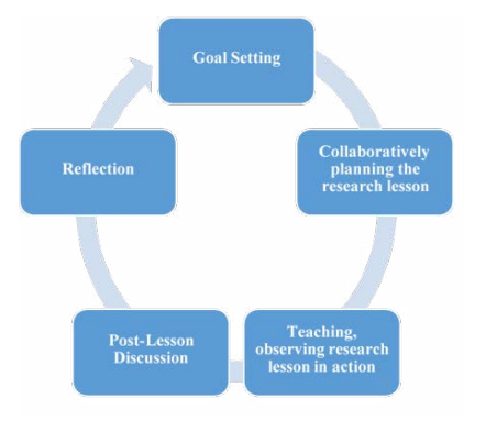
Figure 1 Lesson Study Process (Fujii, 2016)

Lesson study has a cyclical structure and the process of lesson study is described differently by different researchers (Dudley, 2014; Fujii, 2016; Murata, 2011). The lesson study process adopted in the research was designed and conducted inspired by Fujii (2016) presented in Figure 1.