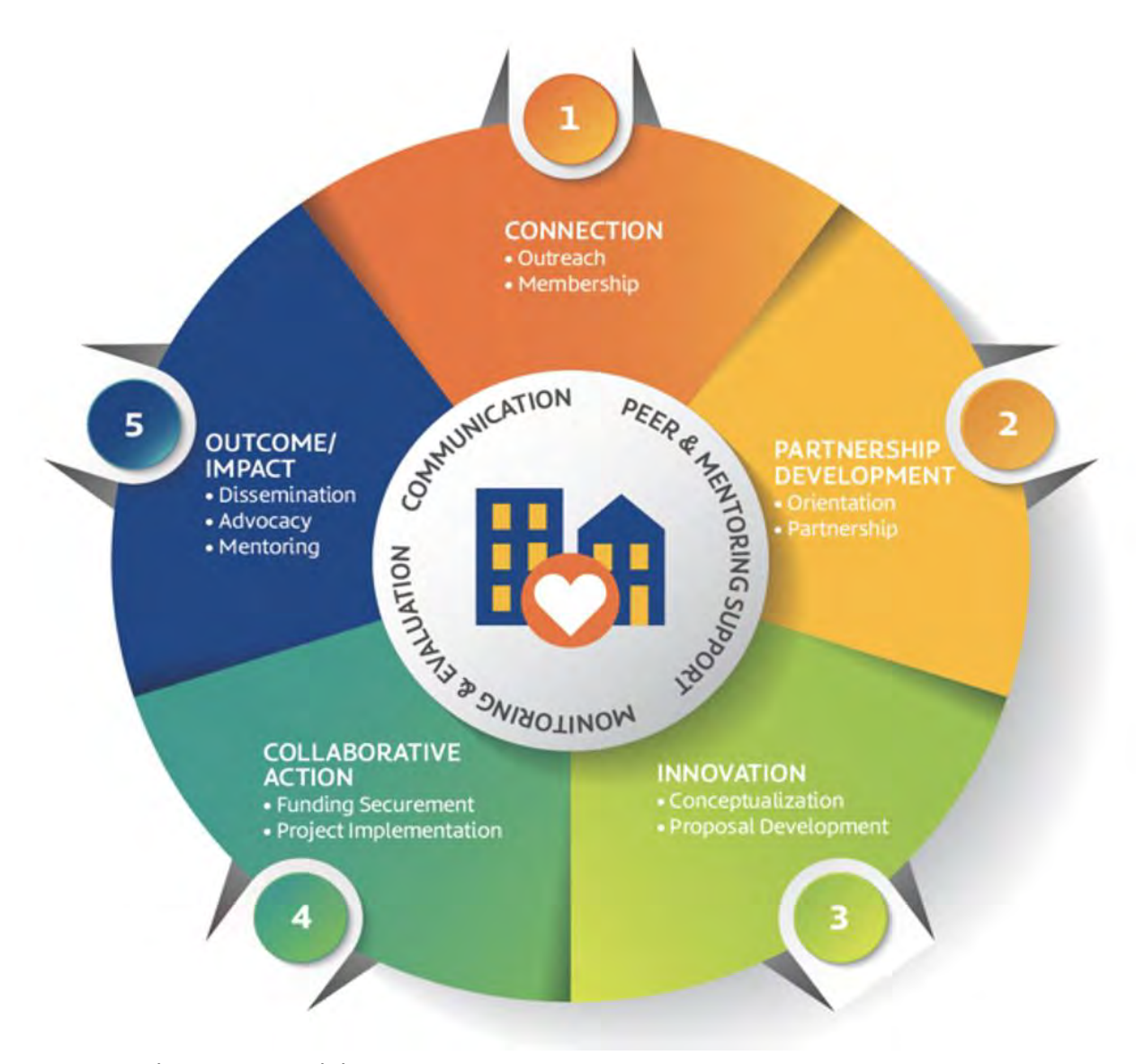
FIGURE 1. The CARES model.