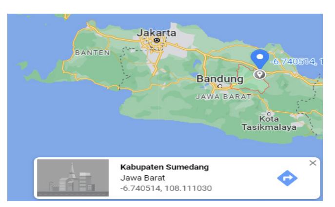
Fig. 1: Location map

This study focused on Sumedang Regency, West Java Province given that it will be a center for education development in West Java Province as indicated by the presence of several of the large universities in Indonesia. Visually, the location of Sumedang Regency is depicted in Figure 1.: